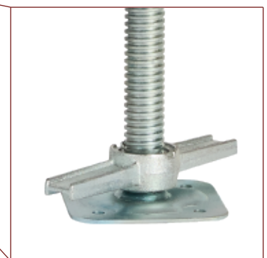
Hot Dip Galvanized